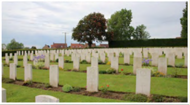
The price of liberty is eternal vigilance