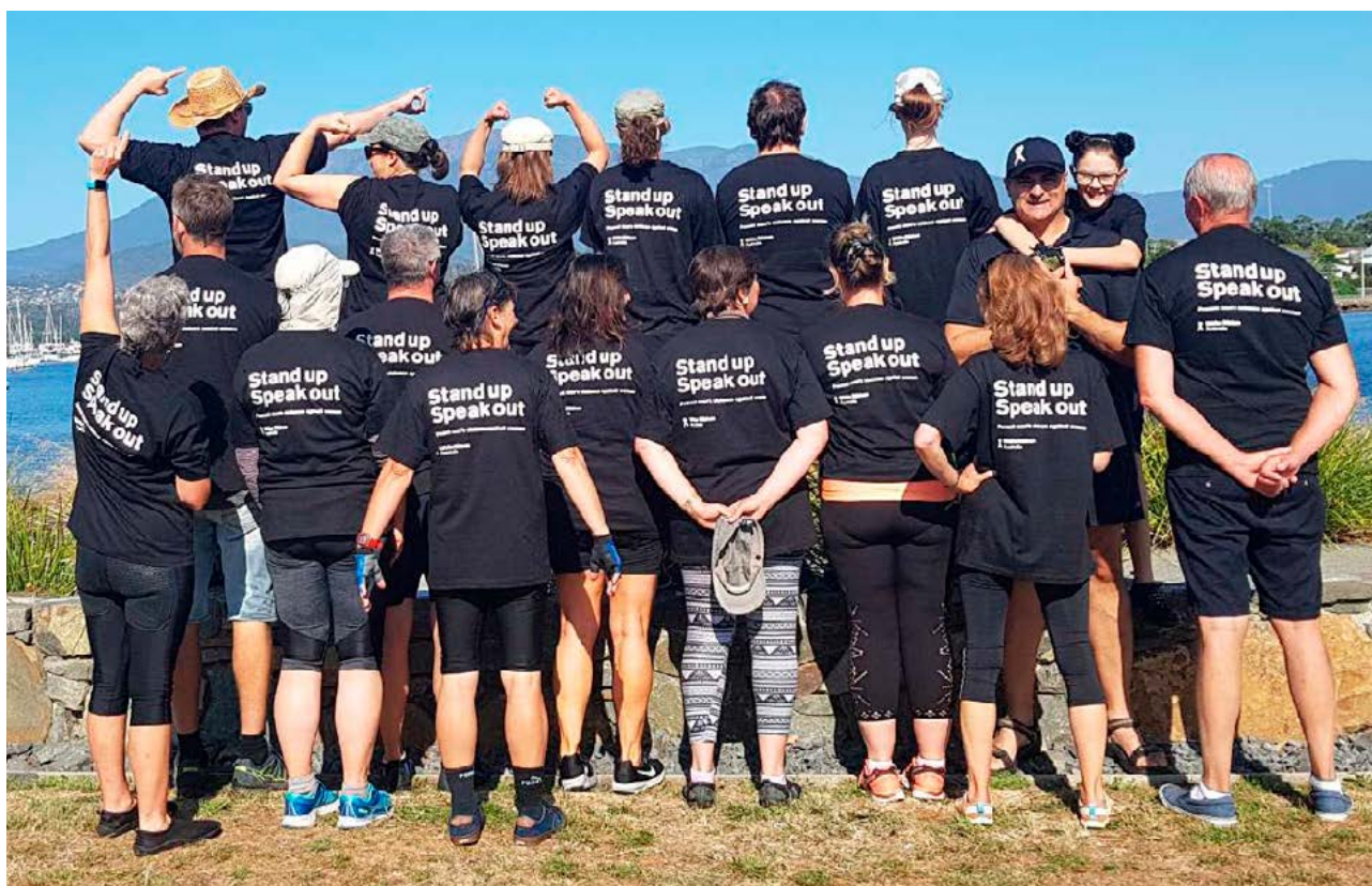
Department of Health employees raise awareness about taking action against family violence at the 2019 Dragons Abreast Dragonboating Corporate Challenge