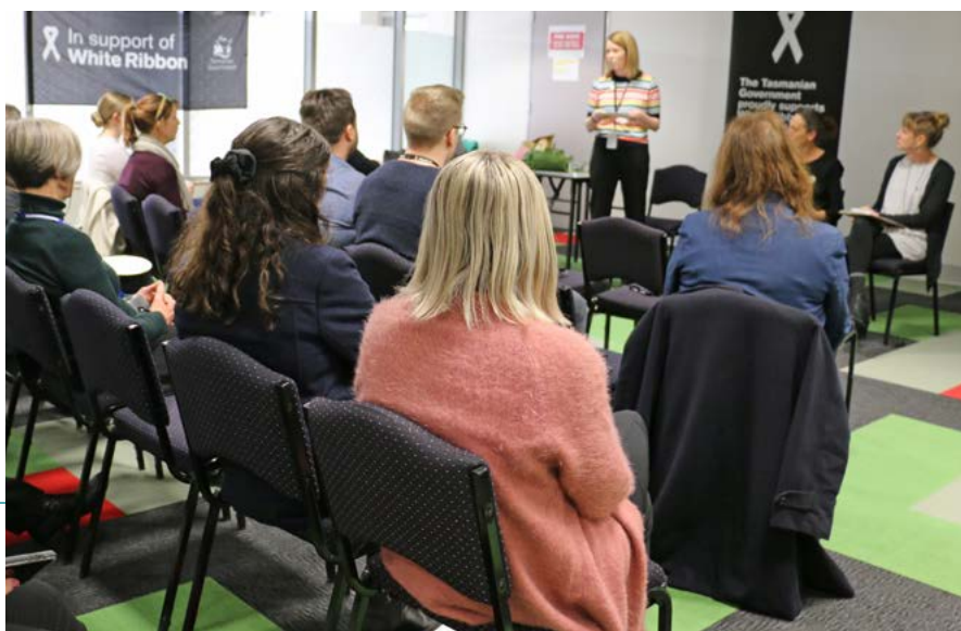
Departments of Health and Communities Tasmania staff participate in an information session about how to support colleagues experiencing family violence