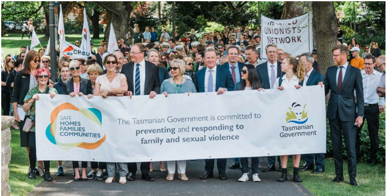
Members of Parliament and the Tasmanian State Service at the Prevention of Family Violence Walk on 25 November 2019, in recognition of the United Nations International Day for the Elimination of Violence Against Women