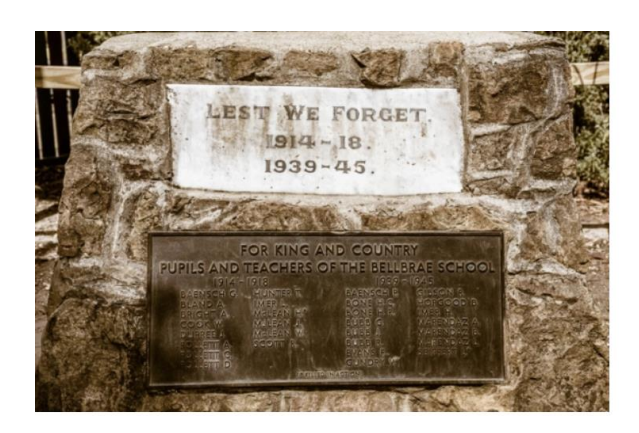
Bellbrae School World War One Roll of Honour