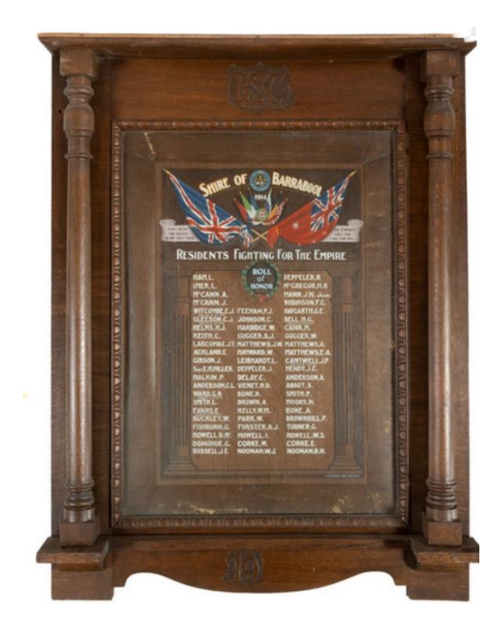
Winchelsea Shire of Barrabool Residents Roll of Honour, Victoria