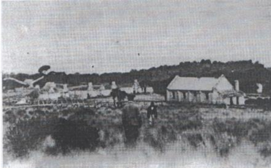
The Wybalenna settlement on Flinders Island, Tasmania