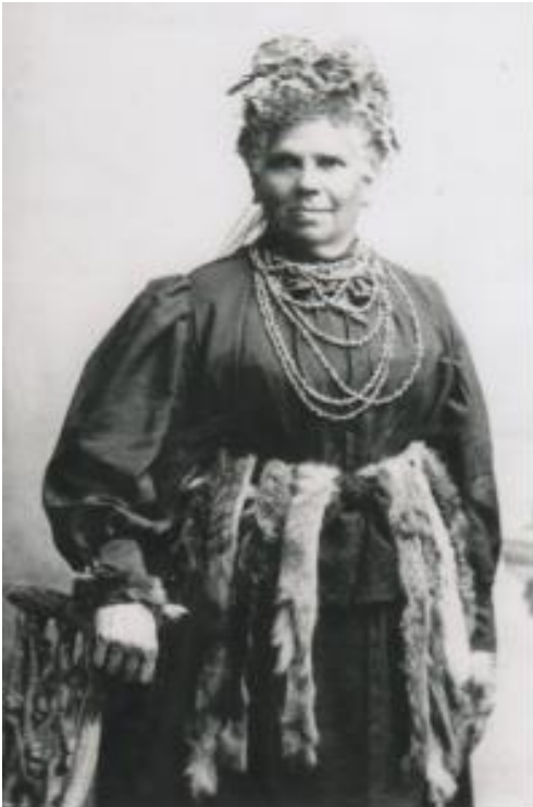
Fanny Cochrane Smith