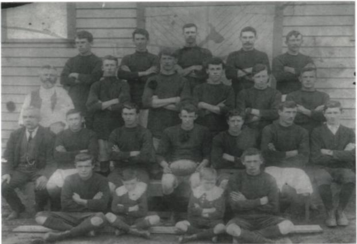
The Nicholls Rivulet football team