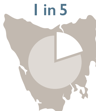
Estimated proportion of Tasmanian population over 65 years of age in 2020

At 30 June 2016, there were 519,128 people living in Tasmania. Of these, 97,608 were over 65 years of age and 205,458 were over 50 years of age (ABS, 2016).