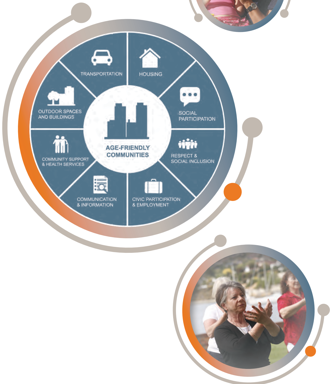
Figure 1: Adapted from the World Health Organisation