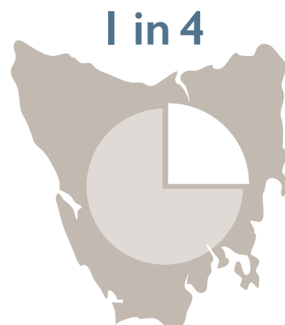
Estimated proportion of Tasmanian population over 65 years of age in 2030

By 2020, it is projected that one in five people will be aged 65 years or older. By 2030, one in four Tasmanian people will be 65 or older.