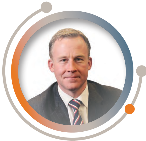
The Hon Will Hodgman MP Premier

Older people are integral members of the Tasmanian community, socially and economically.