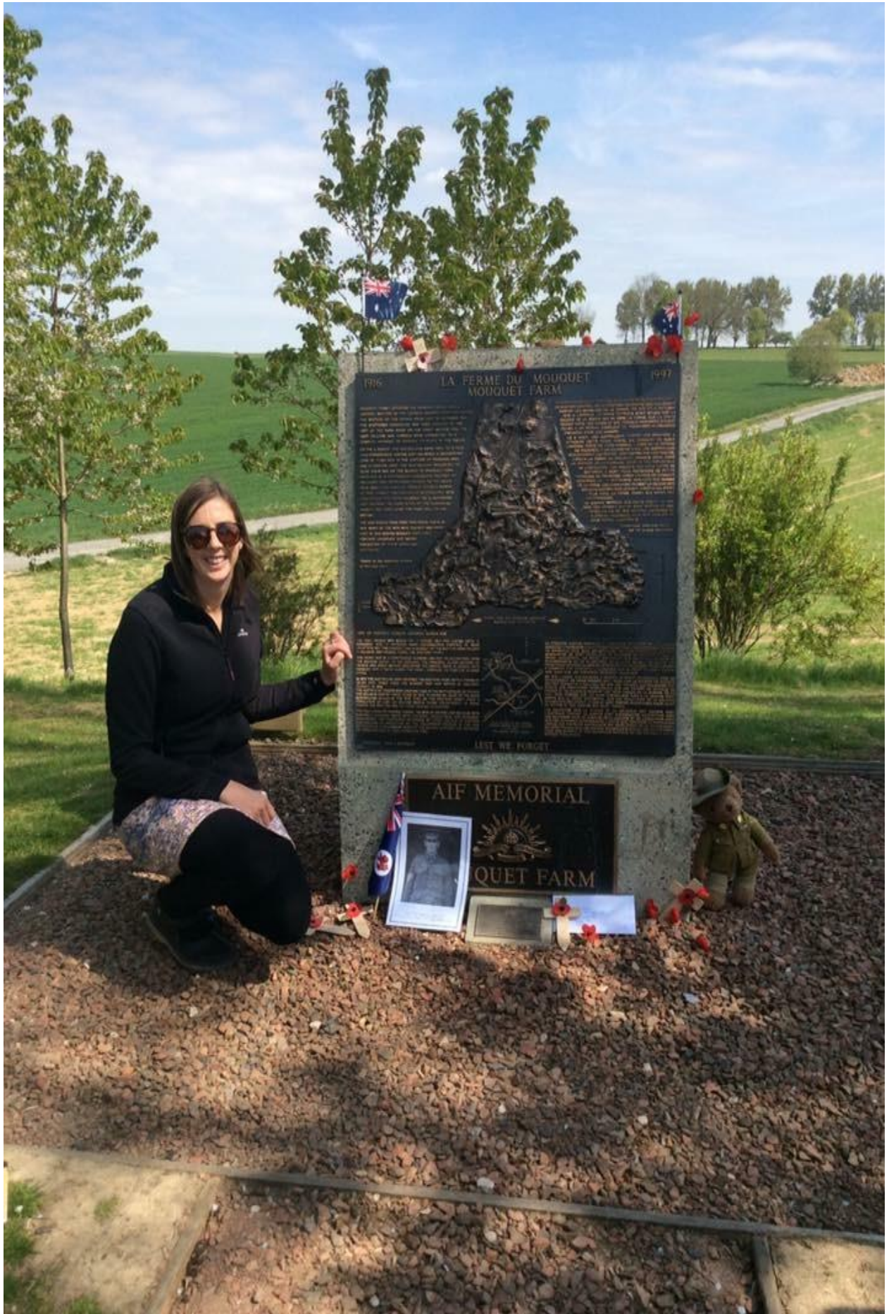
The plaque at Mouquet Farm, April 2017