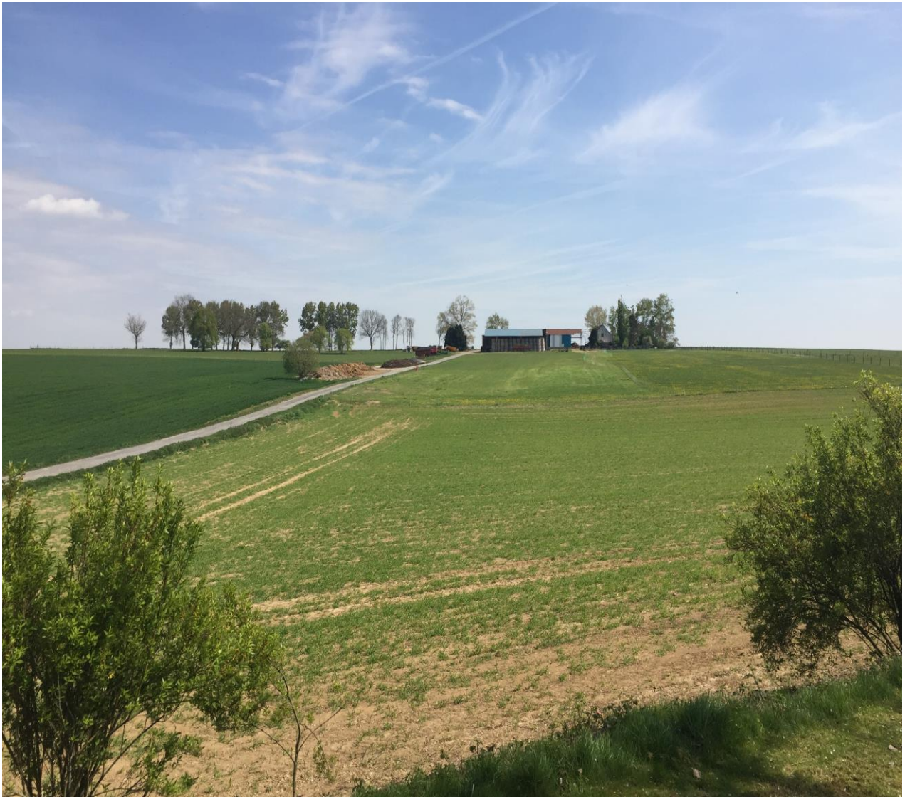
Mouquet Farm, April 2017