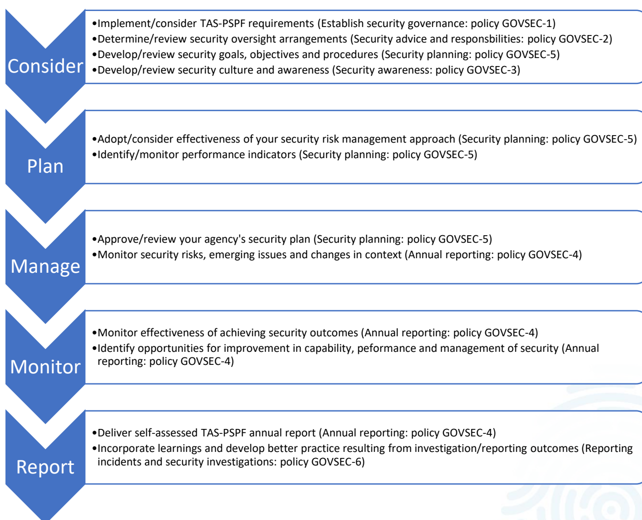
Figure 1 below shows possible information collection points during the process of planning, managing and monitoring your agency's path to security maturity, and aligns each point to the most relevant TAS-PSPF policy.

TAS-PSPF policy: Security planning (GOVSEC-5) requires you to regularly monitor and assess your agency's security capability and risk culture by considering progress against the goals and strategic objectives identified in the security plan. Information collected through security maturity monitoring can be used to inform your agency's annual self-assessment report.