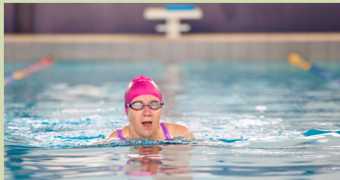
© State of Tasmania January 2014 Images courtesy of the Australian Sports Commission, Paul Hoelen and Special Olympics Tasmania.